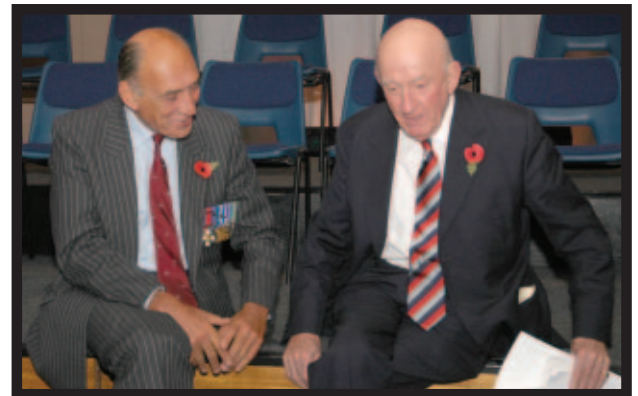
Gen. Sir Mike Jackson and F.M. The Lord Inge KG, GCB, DC, DL