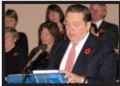
The Marquess of Salisbury, PC