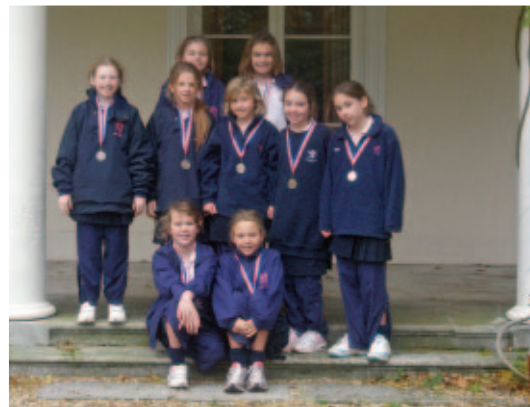
U10 Durlston Netball Tournament Runners-Up