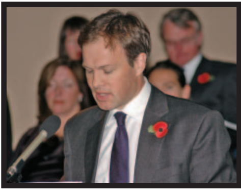
Mr Tom Bradby, ITN Political Correspondent