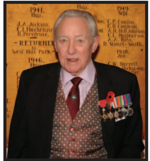
The actor, Mr Richard Todd, OBE

Over £35,000 was raised for the Army Benevolent Fund, The Royal Navy Benevolent Trust and Help For Heroes from Corporate Sponsors and generous donations.