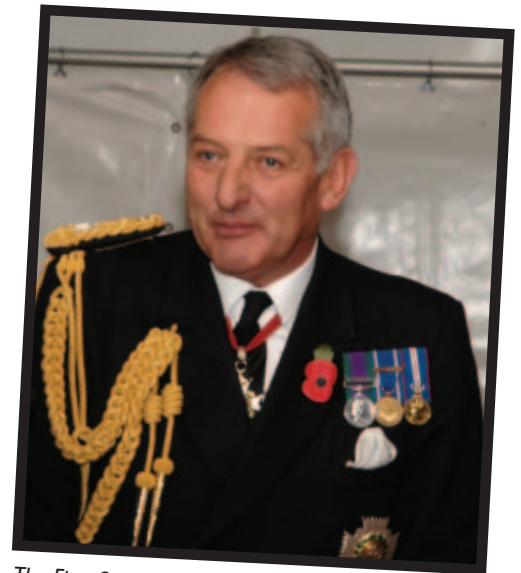
The First Sea Lord Adm. Sir Jonathon Band, KCB, ADC