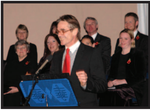
Master of Ceremonies, Mr Jeremy Irons