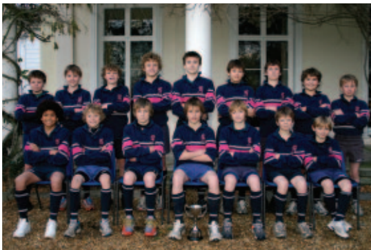
1st XV Hampshire Collegiate Rugby Festival Winners